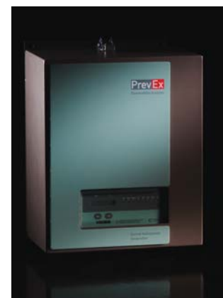
PrevEx Flammability Analyzer

The Company chose to buy one PrevEx analyzer to see how it would perform. They immediately saw the time and cost benefits of the new system: quicker response time, stand-alone independent system that required no controller or associated wiring, automatic calibration eliminating manual adjustments as well as predictive maintenance & on-board diagnostics for easy troubleshooting. After this successful installation the Company chose to purchase several more.